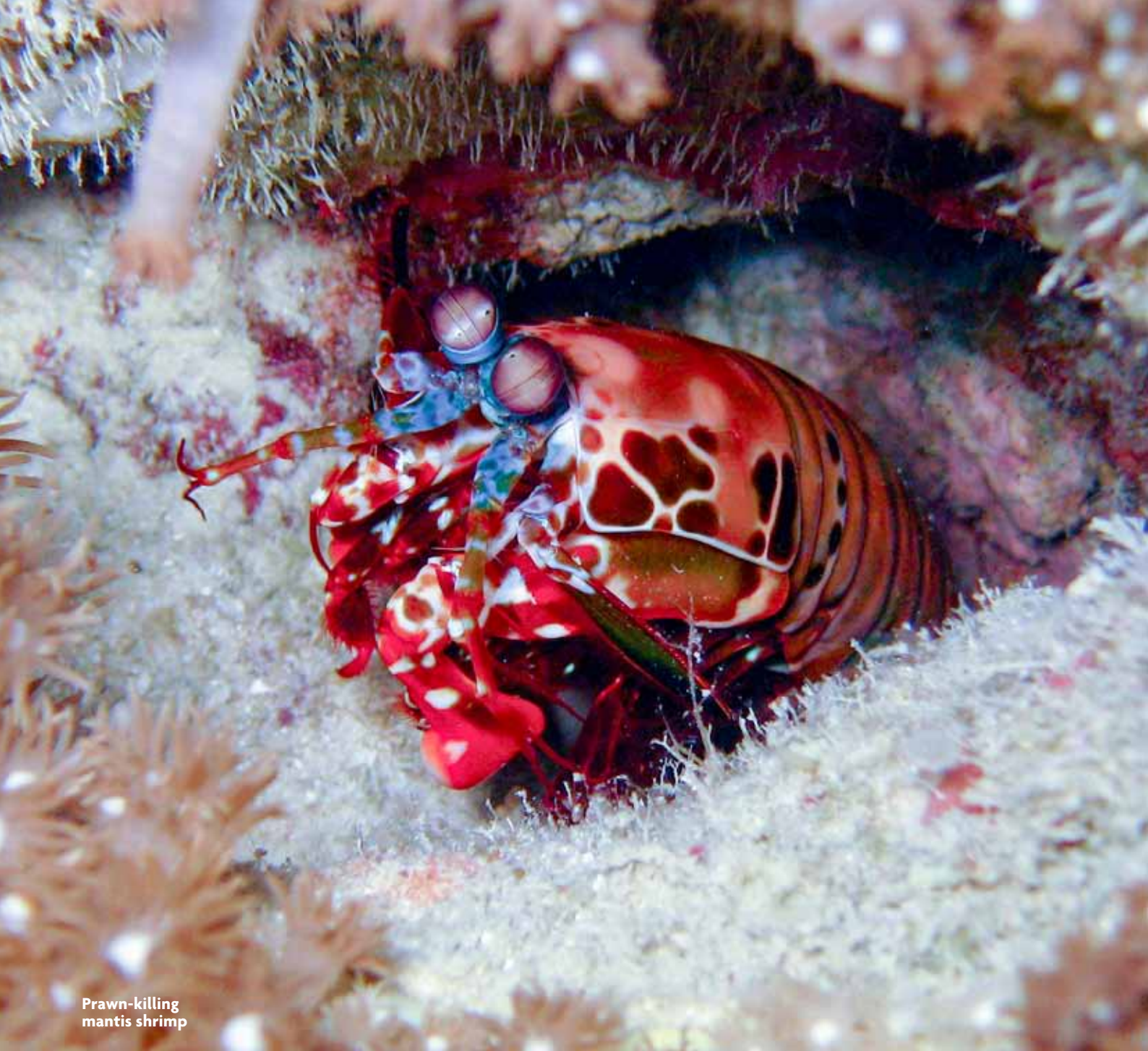
Prawn-killing mantis shrimp

swaying with the current, waiting for passing food. One quick move and they will all disappear, only to re-emerge as soon as the threat has passed on.