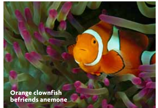
Orange clownfish befriends anemone

dive-bomb a patch of sand and disappear as it spends the night, like many other daytime species, buried.