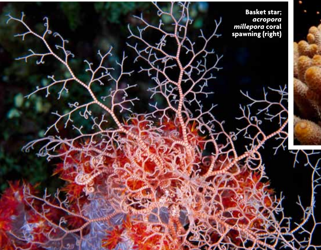
Basket star; acropora millepora coral spawning (right)