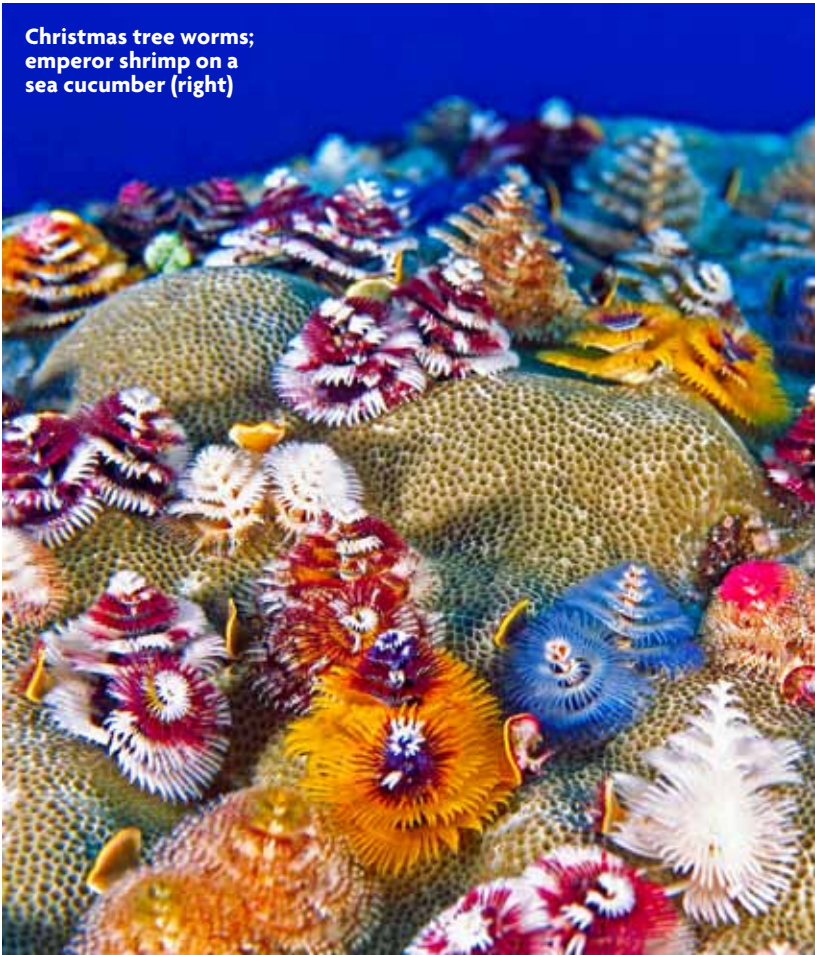
Christmas tree worms; emperor shrimp on a sea cucumber (right)